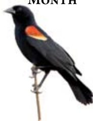
RED WINGED BLACKBIRD